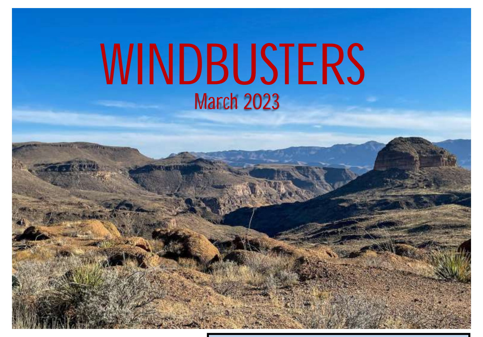
Big Bend