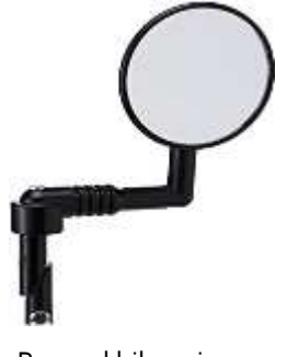
Bar end bike mirror