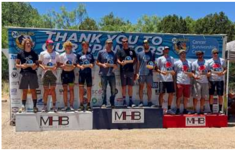
Team Peyton's Bikes 24 hour in the Canyon 4 man team.