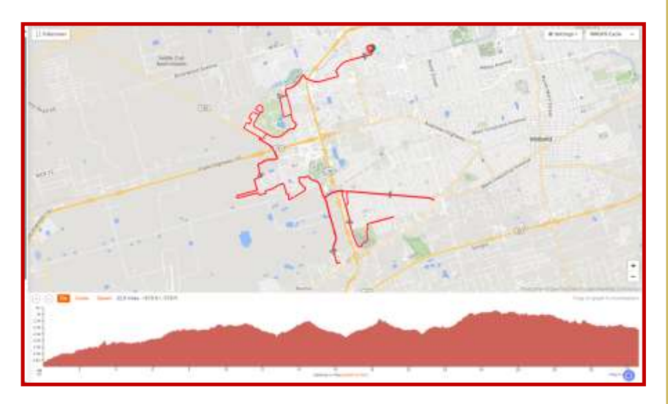
Above: South to Beal Park is a desirable route with a south or southwest wind. Crossing 191 has been very doable, but construction along Hwy 158 at 191 may become a deterrent in the near future. All my routes depart from Trinity Park, but Stonegate Church is a good route start too. There are bike lane lanes along Tradewinds, Beal Parkway, and Thomason on this route. Time of day is an important factor on all routes. My riding generally occurs sometime between 7 a.m. and 3 p.m. depending on the seasonal temperature.