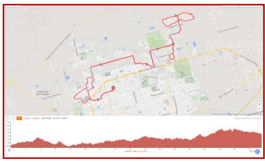
East to Lonestar is an enjoyable ride especially with an east wind. Crossing 349 (North Big Spring St.) requires care and be certain to signal drivers at the intersection that you are going straight across. The Lonestar neighborhood is growing; therefore, the further east one rides, the more construction to be aware of. The neighborhood streets require attention as there are several locations where cross traffic does not stop. There are also stop signs that drivers could easily accidentally run through as could cyclists.