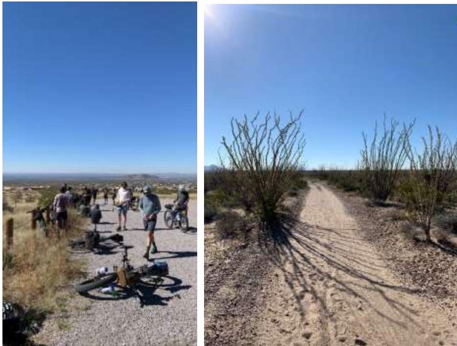
Left: Snack break with Tortugas Mountain in the distance, Right: Riding in the Ocotillo and sand

A few miles into the ride the bike path split (left to the north and right to the south). I went right and on into new territory (I rode the North Loop in 2021). Not far into the bike path we turned uphill away from the highway and the pavement quickly turned to sand as people stopped to shed layers in the rising sun. As we approached Tortugas Mountain, we went south on the Sierra Vista Trail and settled into a 20+ miles of fun singletrack. This is very much a “ride your ride” event so we rode along together and spread out and came back together to stop for snacks very naturally the first half of the day*. At one point I stopped to put a couple bacon strip in Jim’s tire as he got a pinch flat in an arroyo. After 10-20 minutes working on it, we got the tire to hold air and on I rode. We road past an old shed that my band in grad school used to practice in and eventually hit a long downhill paved run to Vado and our first resupply around 3 PM. At about 33 miles into a 70+ mile day, we realized that this was going to be a long day. Luckily it was all roads (mostly unpaved) from here to the first rest station, so I settled into a nice cruise with my new friends from Tucson. We got to Vinton just after Emiliano’s Pizza and Mexican Food closed so ice cream sandwiches from Family Dollar made a nice dinner. From there, it wasn’t far to the end of the pavement (we decided to pass up La Vina Winery in La Union so we could get put some miles behind us before sunset).