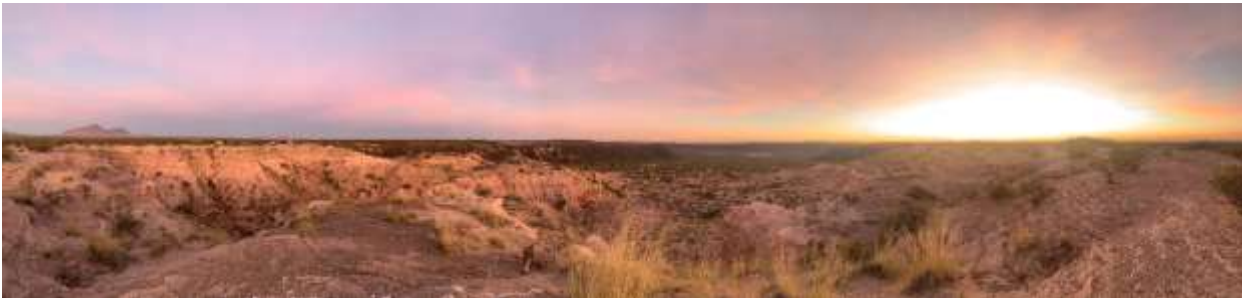
Sunrise at Kilbourne Hole with a big party (camp on left)

I was one of the first to stir before sunrise and before long we were all up and admiring the beauty of Kilbourne Hole. Kilbourne Hole is a volcanic maar formed when magma rose to the surface so fast it hit the water table and flashed it to steam instantly. This caused a huge explosion and left us with a beautiful crater and some (more on the north side) beautiful green rocks to collect. We stood around catching up with everyone we'd ridden with the day before. People all had different ideas and plans. Some would have a lazy morning and enjoy extra coffee and pop tarts and some would head out fast because they knew the closest camp sight was 60+ miles away. A stinging pain in my right big toe told me that the 50 miles back to town would probably be the last of my trip so I hung around camp a little longer and found the friendly Dachshund that kept the coyotes away at night.