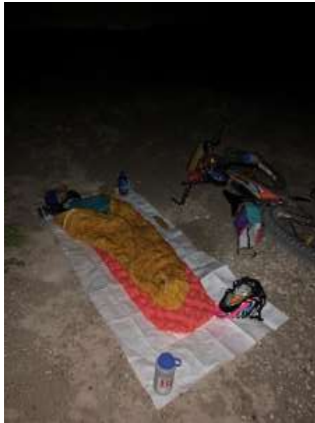
My cozy home on the edge of a volcanic crater

I was one of the first to stir before sunrise and before long we were all up and admiring the beauty of Kilbourne Hole. Kilbourne Hole is a volcanic maar formed when magma rose to the surface so fast it hit the water table and flashed it to steam instantly. This caused a huge explosion and left us with a beautiful crater and some (more on the north side) beautiful green rocks to collect. We stood around catching up with everyone we'd ridden with the day before. People all had different ideas and plans. Some would have a lazy morning and enjoy extra coffee and pop tarts and some would head out fast because they knew the closest camp sight was 60+ miles away. A stinging pain in my right big toe told me that the 50 miles back to town would probably be the last of my trip so I hung around camp a little longer and found the friendly Dachshund that kept the coyotes away at night.