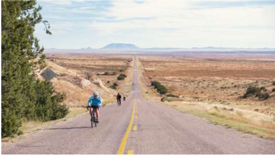
Marfa 100