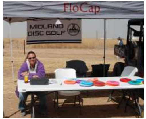
The Midland Disc Golf community were responsible for a lot of the clean up efforts and tire removal in cleaning up the park.