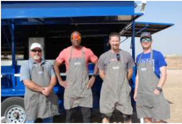
Schlumberger fed the opening day crowd.