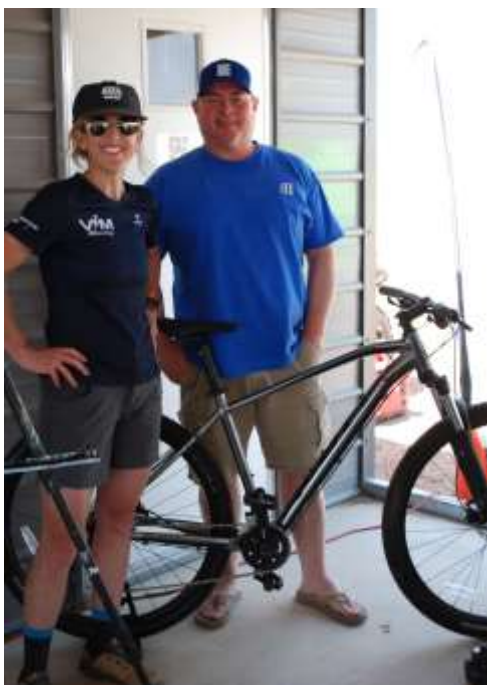
Buffalo Bur's Custom Cycles and Peyton's Bikes raffled new mountain bikes during the lunchtime festivities.