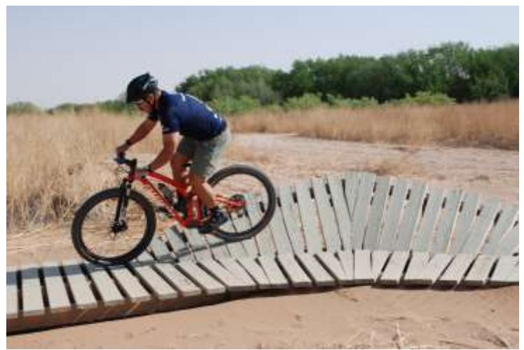
The skills area was popular during the event. Group rides for medium pace riders, women and families were provided to acquaint visitors with the trails.